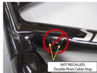
Double Rivet Cable Stop Is Not Recalled

Specialized has determined that if a cable stop becomes loose while riding, this could lead to a fall. Specialized reported its findings to the CPSC and is working in conjunction with the CPSC on this corrective action.