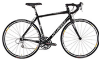
2004 Roubaix Comp

This is a recall notice regarding the Specialized 2004 Roubaix Comp 18, 2004 Roubaix Comp 27, 2004 Roubaix Pro 18, and 2004 Roubaix Pro Frameset involving composite frames only and single rivet cable stops only. This recall notice is not for the 2004 Roubaix model involving aluminum frames and two rivet cable stops.