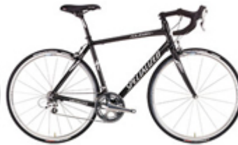
2004 Roubaix Pro